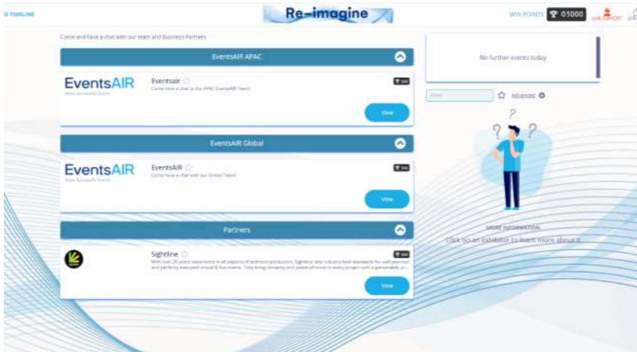
Example of one-on-one meeting between delegate and exhibitor: